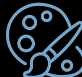
FINE ART & COLLECTIBLES