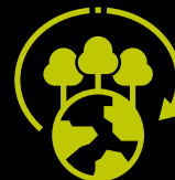
ENVIRONMENTAL & CONST. PROF.